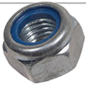
DIN 985 Standard withdrawn